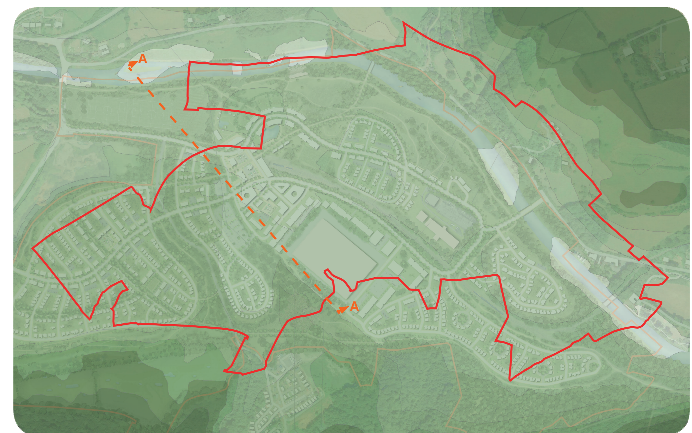
Key Plan (not to scale)

Dimensions to be verified on site. Use 30mm dimensions only. Do not work from reduced scale drawings. Please refer to scale and sheet size as indicated. This drawing is the property of ELEGANT DESIGN ARCHITECTS LTD. Copyright is reserved for them and the drawing is issued on the condition that it is not copied, reproduced, related or distributed to any unauthorised persons without the prior consent in writing of Leonard Design Architects Ltd. All rights reserved. DO NOT SCALE ORIENTATION